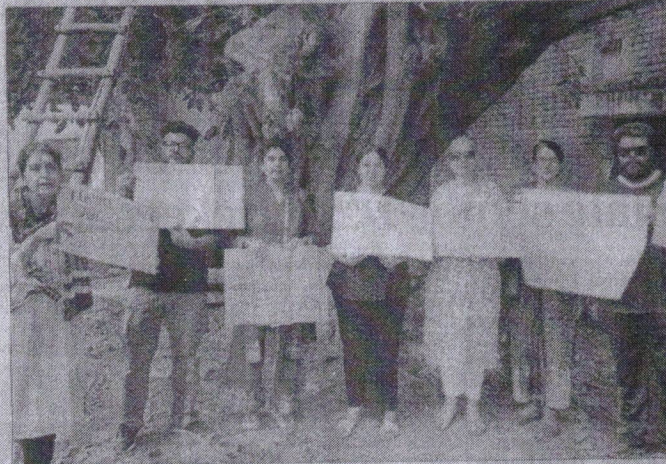
Environmental activists stage a protest at the Civil Hospital, Jalandhar, against tree felling.